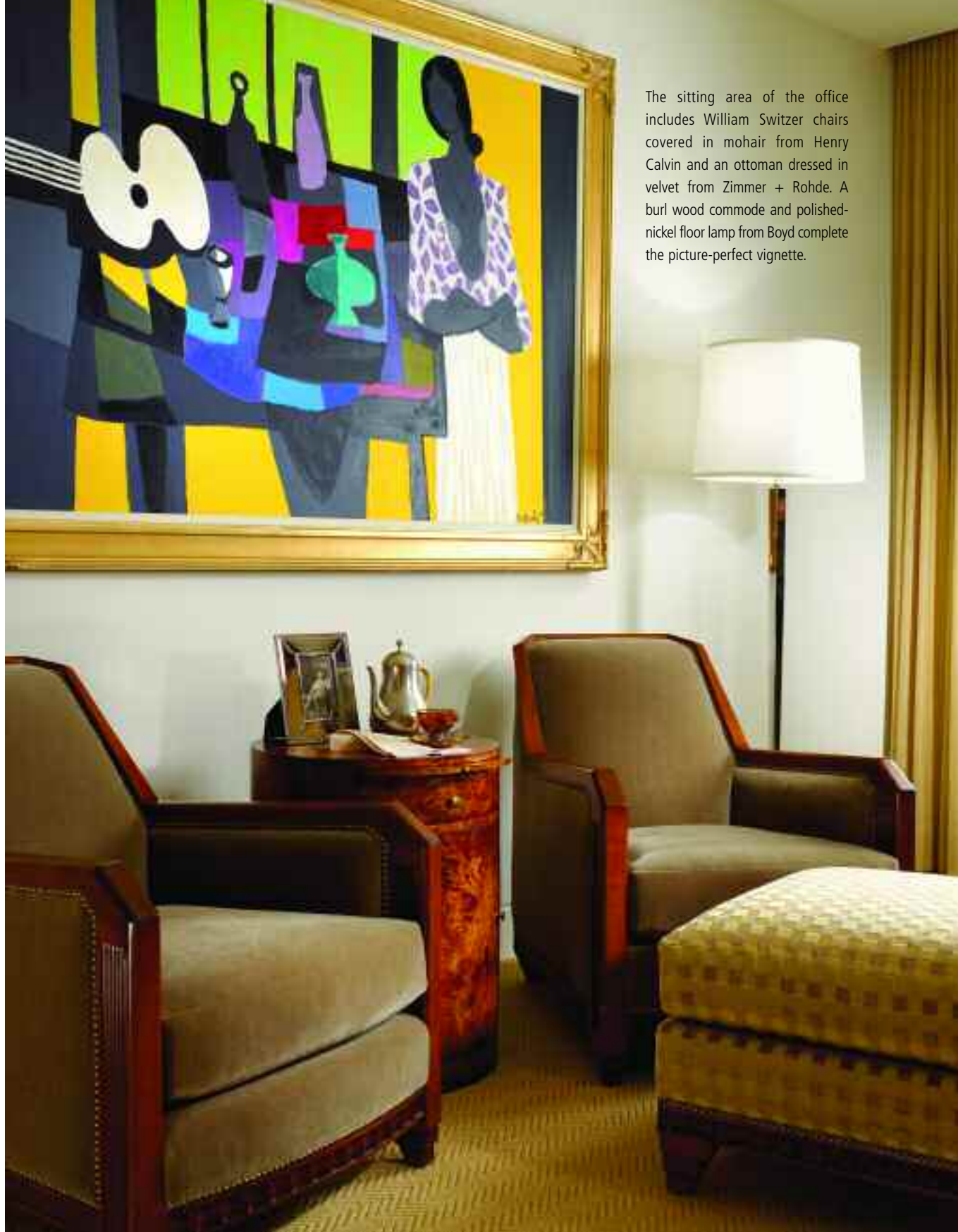
The sitting area of the office includes William Switzer chairs covered in mohair from Henry Calvin and an ottoman dressed in velvet from Zimmer + Rohde. A burl wood commode and polished-nickel floor lamp from Boyd complete the picture-perfect vignette.

"I love the contrast of Deco with the Picasso-esque painting," Shuster says, referring to the chairs and table set against Marcel Mouly's acrylic, 'La Creole a la Guitare Blanche.'